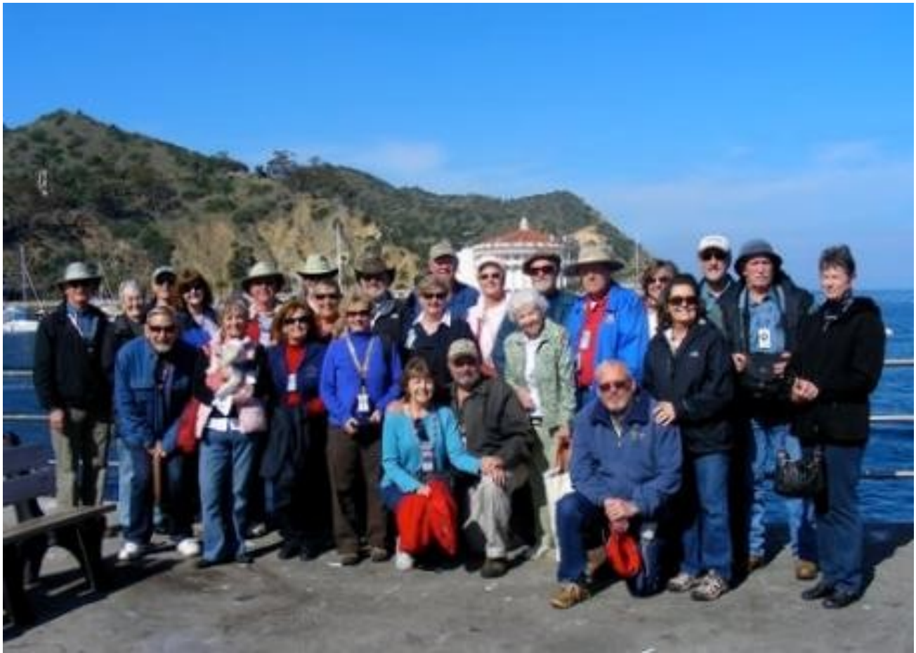
NorCal Unit members from the All-Terrain Caravan (Background is the Casino on Catalina Island)