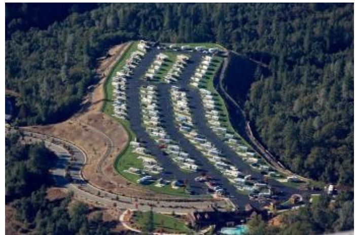
An aerial view of the Rally