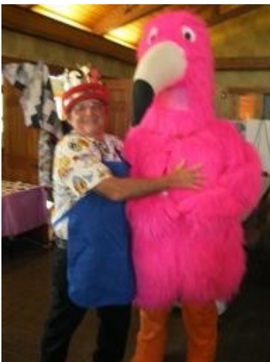
Some Pictures from the Rally