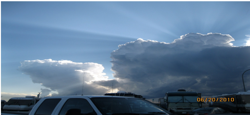
Typical sky in Gillette, WY, during the International Rally.