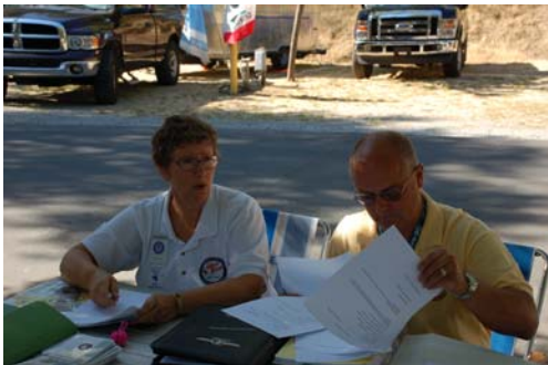
Very important unit meeting!